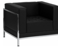
SORRENTO CHAIR BLACK