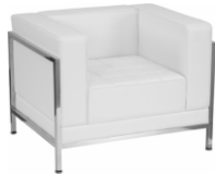
SORRENTO CHAIR WHITE